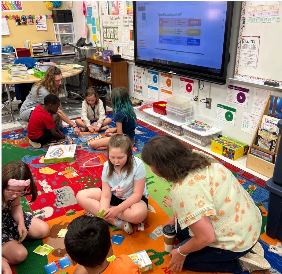
Video - Student Debrief from Ashley River Creative Arts

Provides ENRICHMENT opportunities for ALL